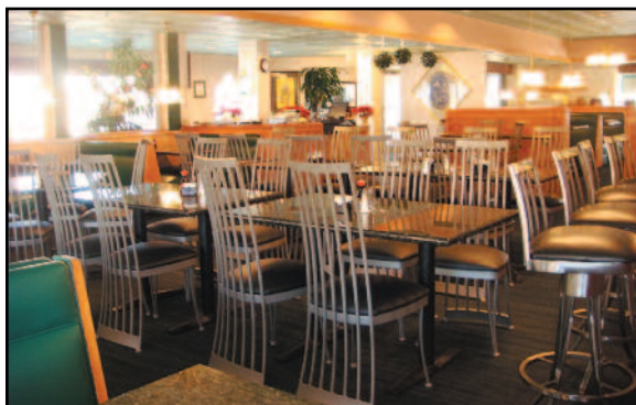
Crystal Jade, a new Asian eatery in Omaha from the owners of Jade Palace in Bellevue, features Malaysian, Indian, Vietnamese, Korean and American dishes as well as Chinese-American standards.

The Malaysian pad thai was subtle and delicious, with wide flat noodles that seemed to soak up more of the layered but